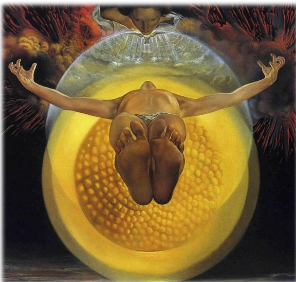
"The Ascension of Christ" by Salvador Dali

When they had come together, they asked, "Lord, is this the time when you will restore the kingdom to Israel?" Jesus replied, "It is not for you to know the times or periods that have been set by God's own authority. But you will receive power when the Holy Spirit has come upon you; and you will be my witnesses in Jerusalem, in all Judea and Samaria, and to the ends of the earth." When Jesus had said this, as they were watching, Jesus was lifted up and hidden from their sight by a cloud.