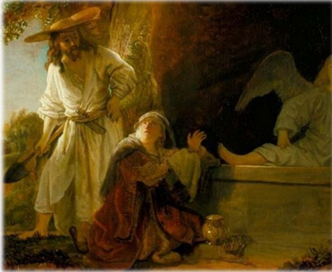
"Christ and Saint Mary Magdalen At The Tomb" by Rembrandt Harmenszoon van Rijn

Mary stood weeping outside the tomb. As she wept, she bent over to look into the tomb; and she saw two angels... They said to her, "Woman, why are you weeping?" She said to them, "They have taken away my Lord, and I do not know where they have laid him."