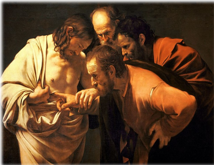
"The Incredulity of Saint Thomas" by Caravaggio

Thomas (who was called the Twin ), one of the twelve, was not with them when Jesus came. So the other disciples told him, "We have seen the Lord." But he said to them, "Unless I see the mark of the nails in his hands, and put my finger in the mark of the nails and my hand in his side, I will not believe." A week later the disciples were again in the house, and Thomas was with them. Although the doors were shut, Jesus came and stood among them and said, "Peace be with you."