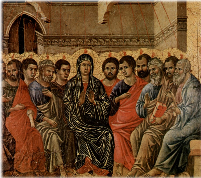
"Pentecost" by Duccio di Buoninsegna

Then they returned to Jerusalem from the mount called Olivet, which is near Jerusalem, a sabbath day's journey away. When they had entered the city, they went to the room upstairs where they were staying, Peter, and John, and James, and Andrew, Philip and Thomas, Bartholomew and Matthew, James son of Alphaeus, and Simon the Zealot, and Judas son of James. All these were constantly devoting themselves to prayer, together with certain women, including Mary the mother of Jesus, as well as his brothers.